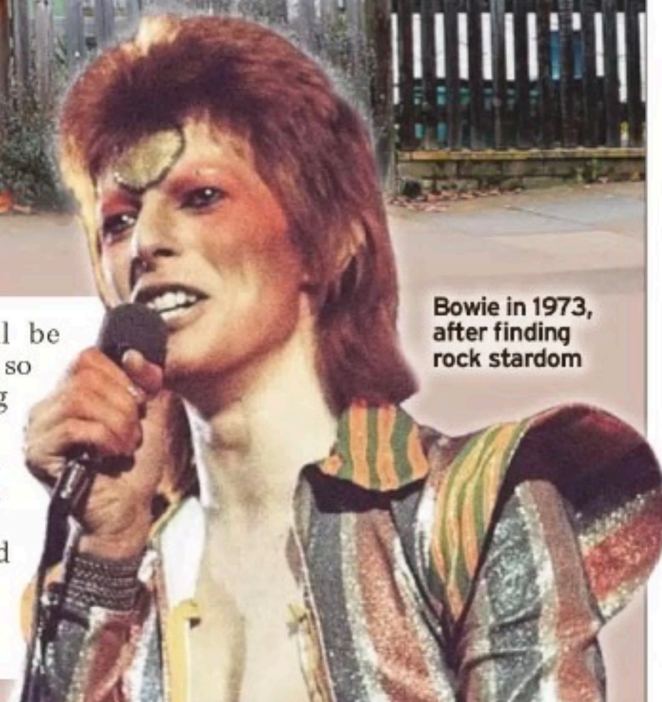
Bowie in 1973, after finding rock stardom