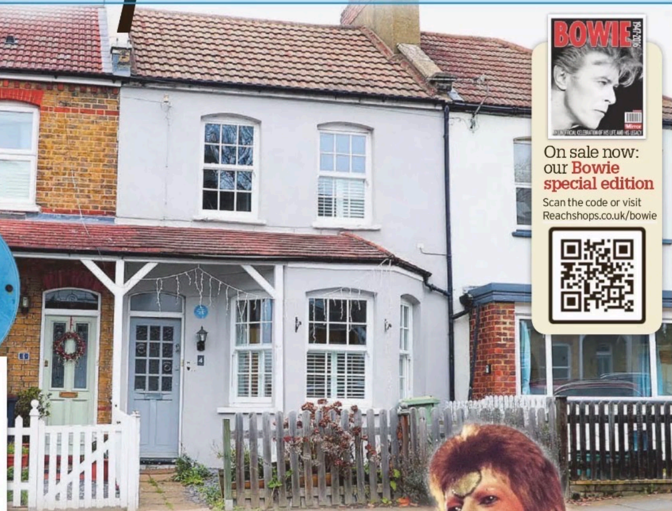
Home where youngster plotted his music career