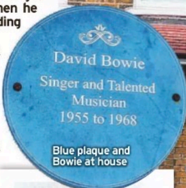
Blue plaque and Bowie at house

"As he said, 'I spent so much time in my bedroom. It really was my entire world. I had books