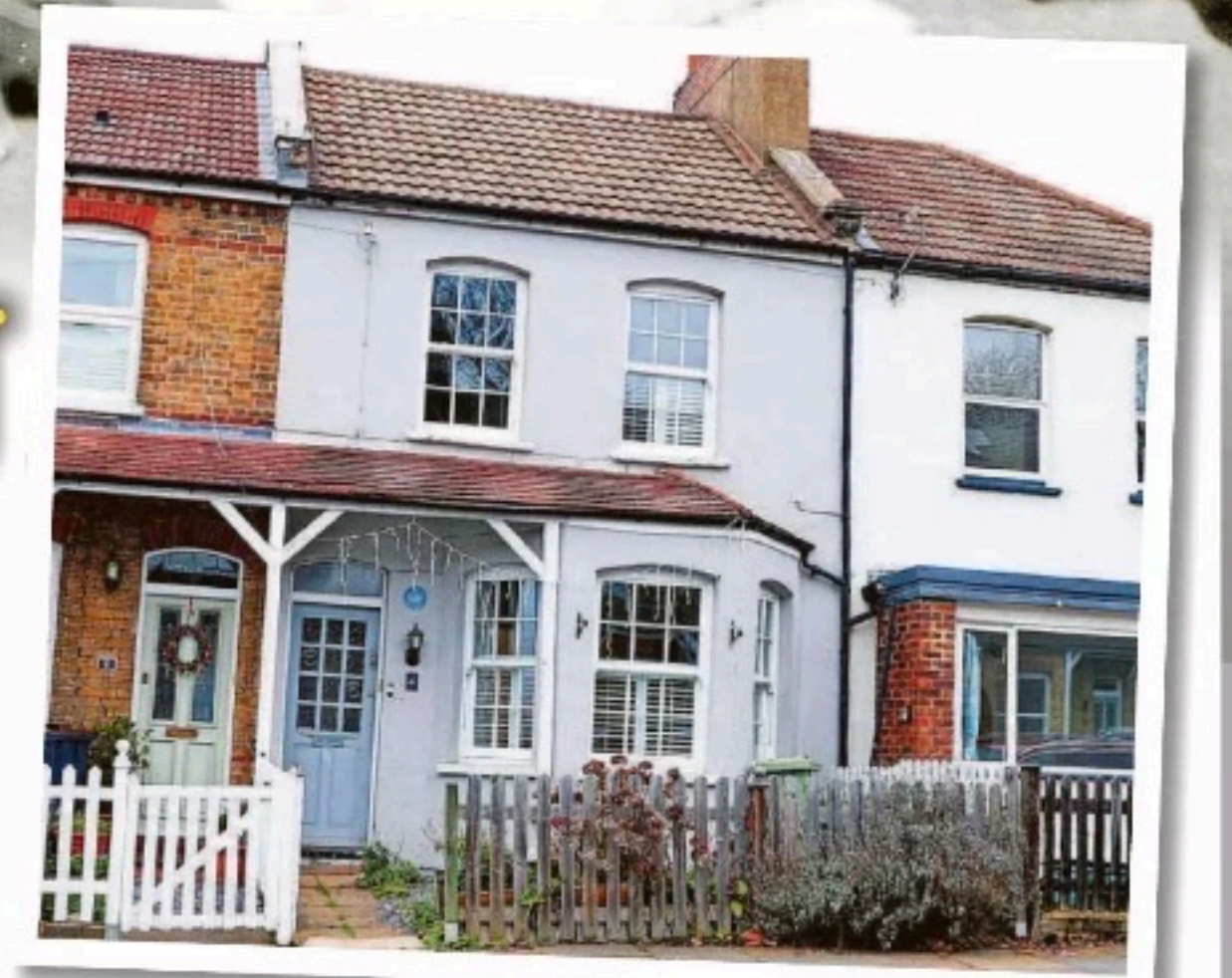
OPEN HOUSE: Bowie's childhood home at 4 Plaistow Grove, Bromley